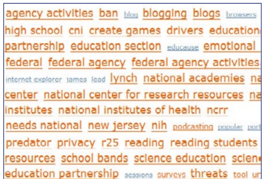
Tag Cloud of a NITLE Blog Generated by < http://tagcloud.com/ >, October 2005

Social bookmarking is one of the signature Web 2.0 categories, one that did not exist a few years ago and that is now represented by dozens of projects. The very strangeness of the term (what's social about bookmarks?) summons up much of the Web 2.0 ethos. It was launched by the advent of Joshua Schacter's del.icio.us (a cleverly spelled URL, using the rarely seen U.S. suffix)—an elegant, focused, and unassuming service for storing, describing, and sharing bookmarks. Users register and then personalize their bit of del.icio.us ( http://del.icio.us/ ) with a minimally designed page, including nothing beyond annotated