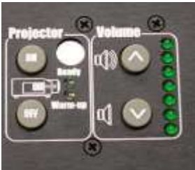
Projector and Volume Controls