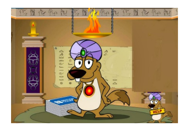
FIGURE 1. Can be read your mind?