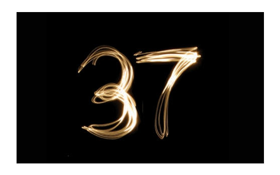
FIGURE 2. The power of 37

MatheMAGIC Sometimes math can be so mysterious it seems like MAGIC. By noticing some patterns, we were able to impress and amaze with our ability to multiple double digit numbers (as long as our pal 37 was involved). We could also form Fibonacci sequences and then add up the first ten terms in no time at all. And that magic gopher? Well, he is cute but it turns out he's not magical at all. If you want to retry the Magic Gopher mind reading, go to http://www.learnenglish.org.uk/games/ magic-gopher-central.swf and see if you can explain how he always knows the symbol. Thanks to math4love for the notes for portions of this topic http://mathforlove. com/lesson/the-power-of-37/